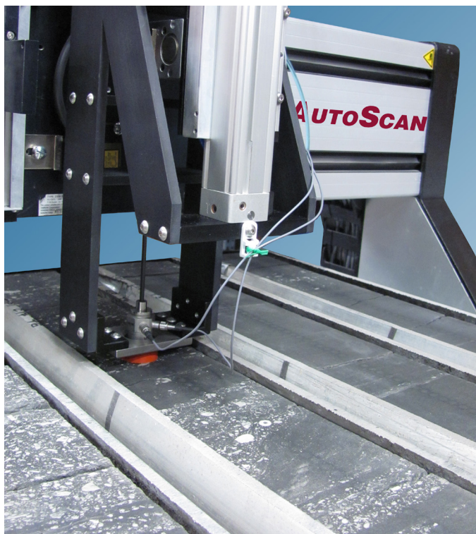
The Impulse Hammer Probe is used to characterize the variability of elastic stiffness and mechanical strength

sequentially during the same scan. Both compressional and shear velocities can be measured in two orthogonal orientations on the core, providing a means to quantify anisotropy in elastic properties.